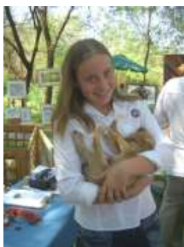
The comfort Zone