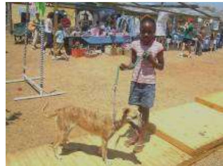
DOG AGILITY WINNER

MANY DIFFERENT STALLS SELLING CLOTHES – BOOKS – SECOND HAND GOODS - BEER GARDEN – FACE PAINTING ETC.