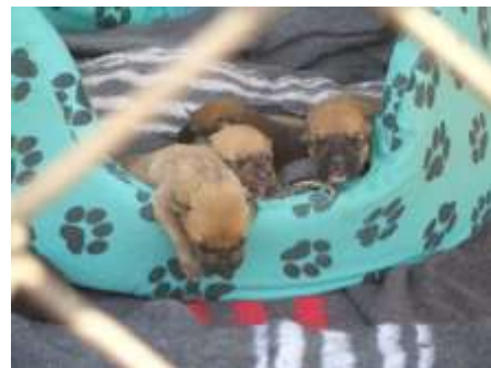
The young ones