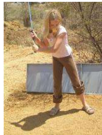
GOLFING SKILLS ABOUND