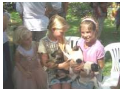
And the older ones.