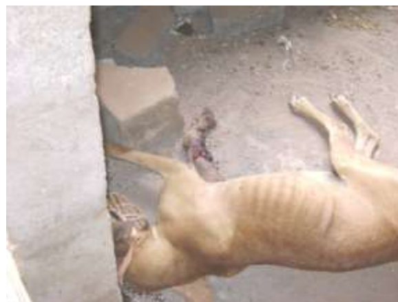
The end result of wanton brutality.