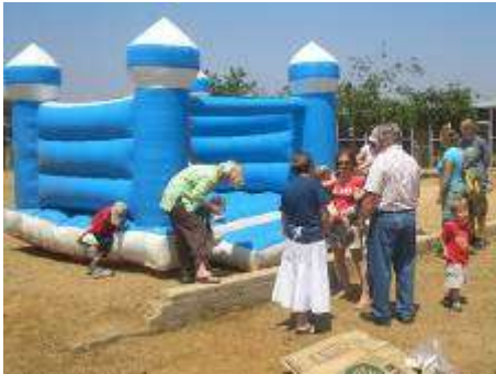
JUMPING FOR JOY

MANY DIFFERENT STALLS SELLING CLOTHES – BOOKS – SECOND HAND GOODS - BEER GARDEN – FACE PAINTING ETC.